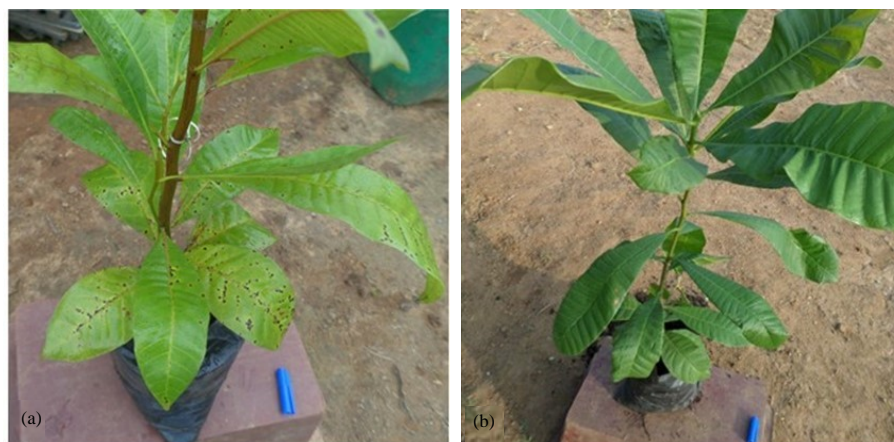
Fig. 3(a-b): Comparison of inoculated and non-inoculated cashew seedlings. (a) Necrotic black spot of Colletotrichum sp. on leaves inoculated and (b) Control plant leaves with any symptom

Column diagrams with the same letter are not significantly different using Newman-Keuls test. Vertical bars represent the Standard Error (SE)